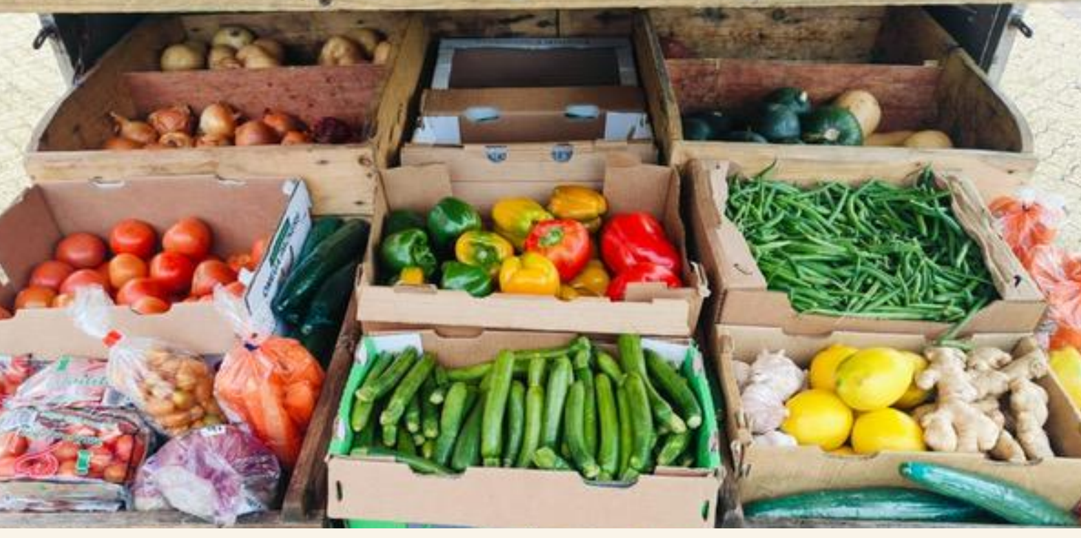
Cash or Card payments accepted