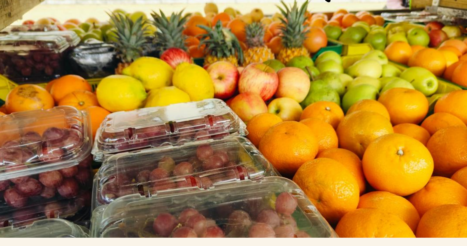
Fresh Fruit & Veg every Wednesday from 8.30am