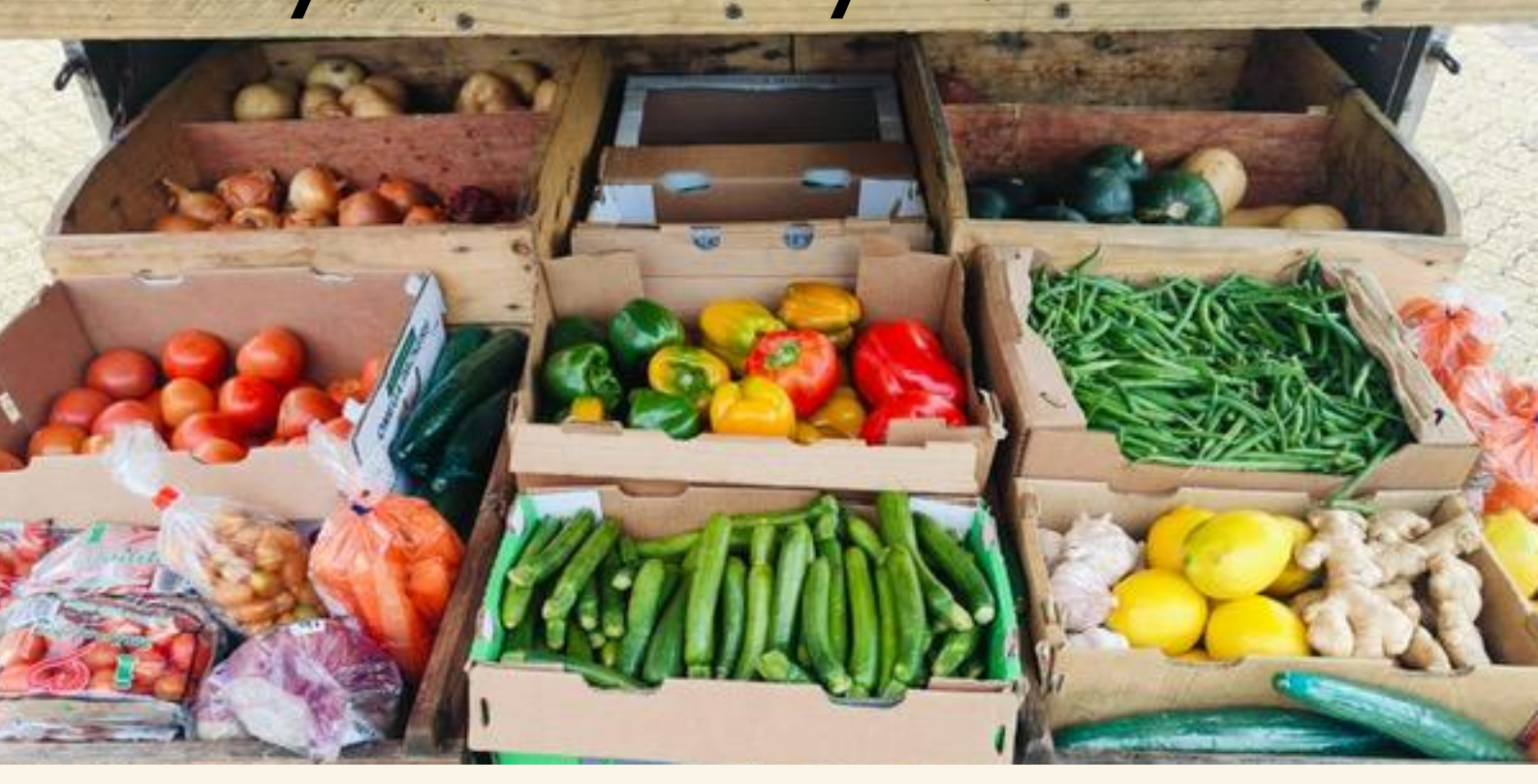
Cash or Card payments accepted