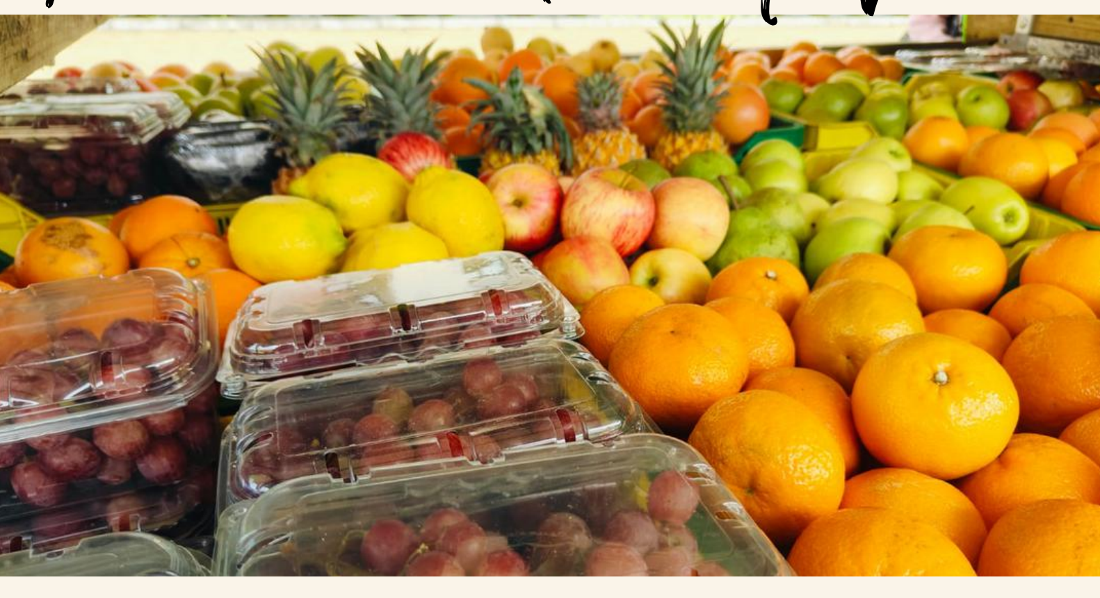
Fresh Fruit & Veg every Wednesday from 8.30am