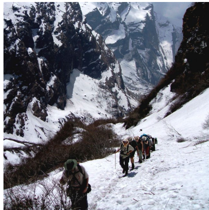
July winner - Mountains