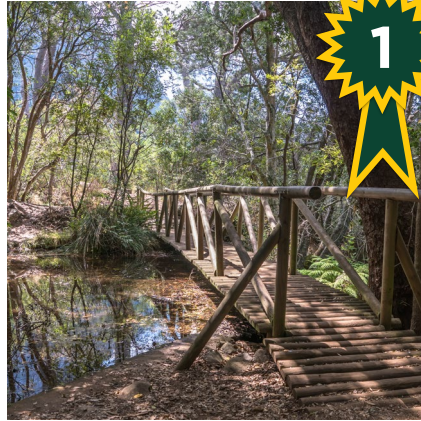
April winner - Bridges