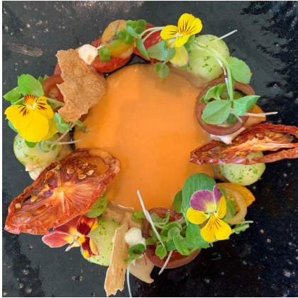
March winner - Food

What a year we've had - some incredible entries, despite lockdown! We've been so impressed by the entries and there were some robust discussions when choosing finalists. So without further ado, here are our winners of 2020!