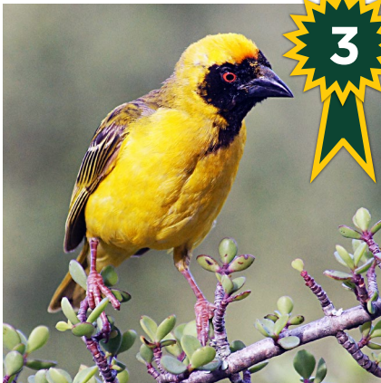
June winner - Birds