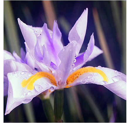
May winner - Flowers