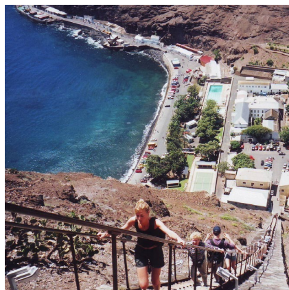
October winner - Towns