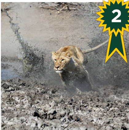
September winner - Animals