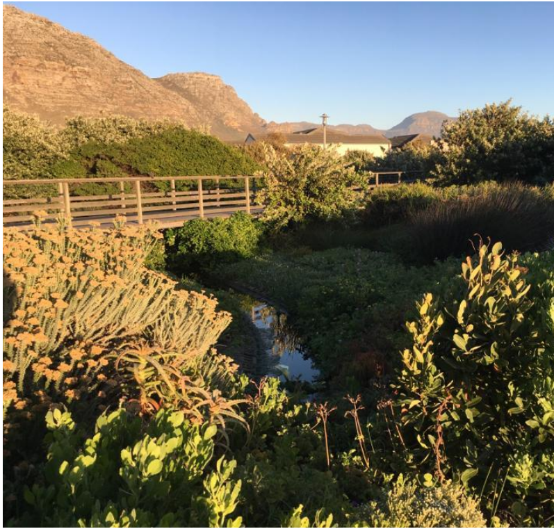
Our Beautiful village first thing in the morning