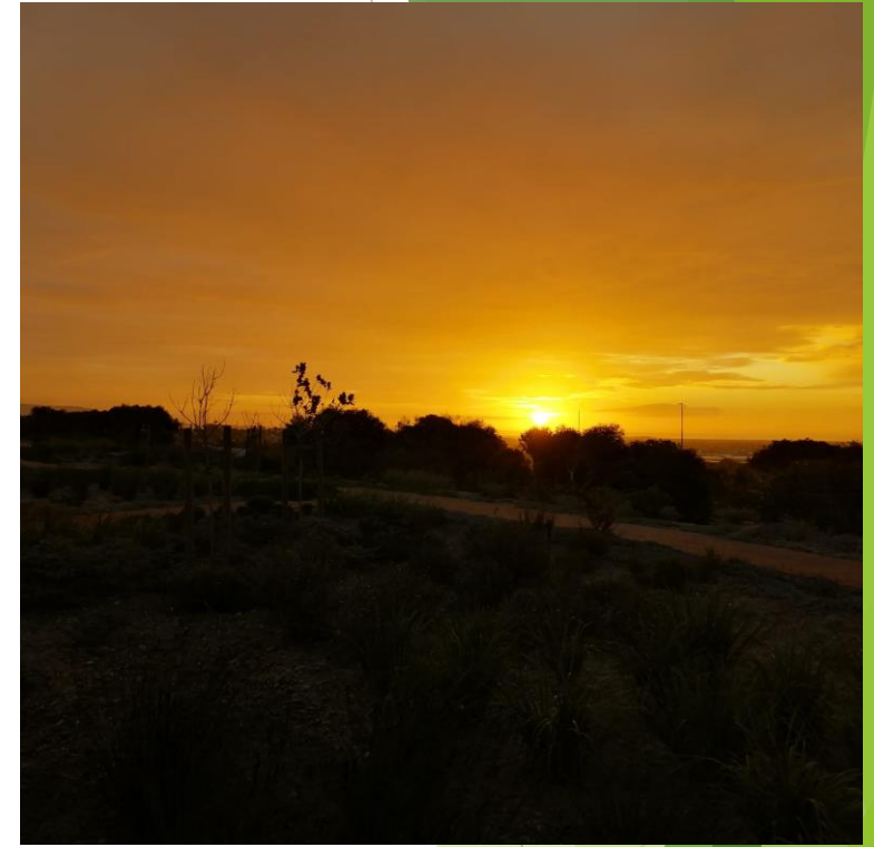
Beautiful sunset at Evergreen Noordhoek