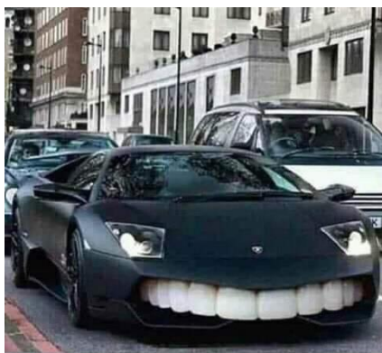
This is a dentist's car Shall send a pic of a gynecologist's car tomorrow

I hate it when I see an old person and then realize that we went to high school together.