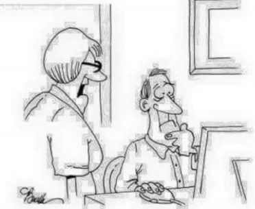
"What do you mean, you forgot where you parked? You're shopping online."