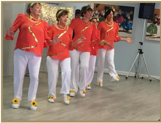
“The Companions” entertained our Care Centre residents on 15 August. What a treat!