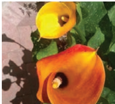
Hybrid Arum