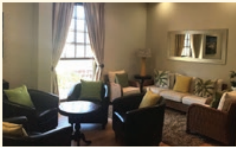
Extention to clubhouse