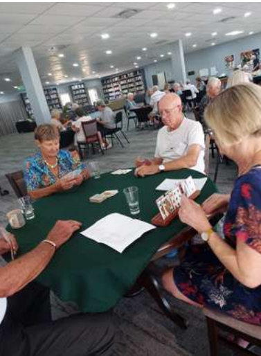
A fun- filled afternoon with some special guests from Evergreen Muizenberg