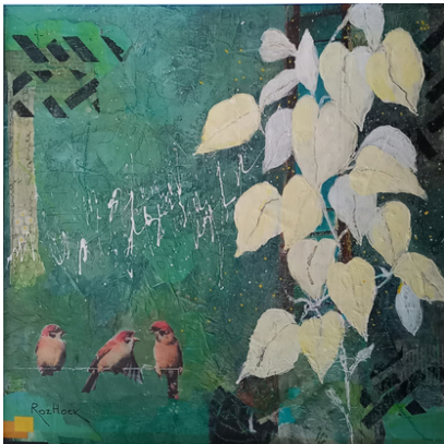
(Stay Away from my Girl)

Richard Crowie Hall, Kirstenbosch Gardens