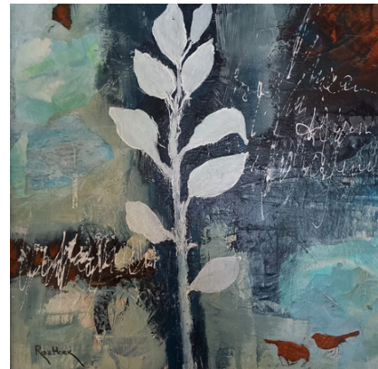
(White Plant & Two Little Birds)

Kirstenbosch Gardens is hosting an art exhibition from the 14th to the 25th of April at Richard Crowie Hall . The gardens have existed for over a century and host a variety of beautiful flora unique to South Africa.