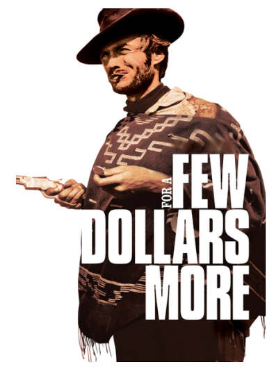
For a Few Dollars More 22nd February

To book, please put your name on the booking list once shared on the notice board.