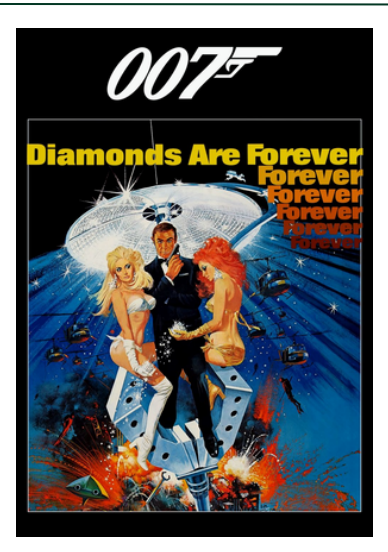
Diamonds Are Forever 14th February