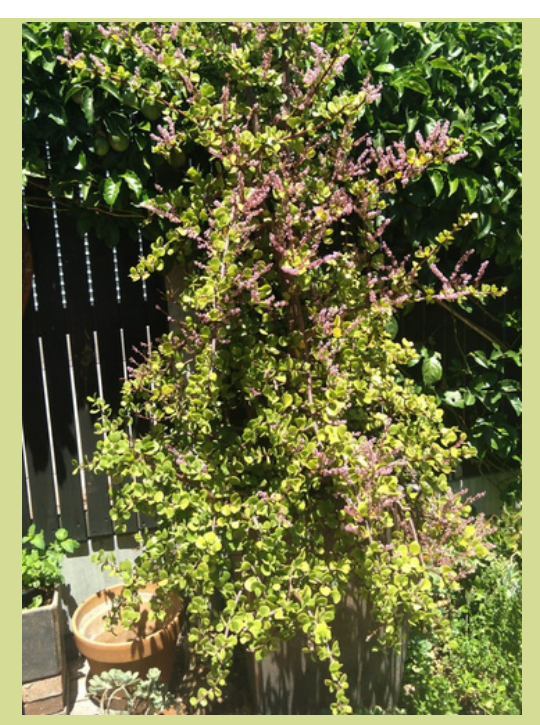
'Spekboom in flower' - House 91 Shona Farquharson

For further information kindly contact Val Stockden on Ext. 2056.