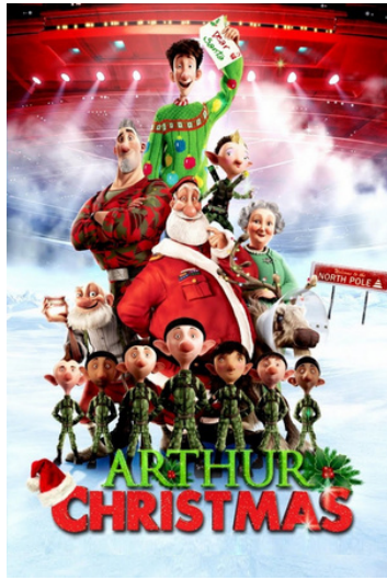
Arthur Christmas 21st December