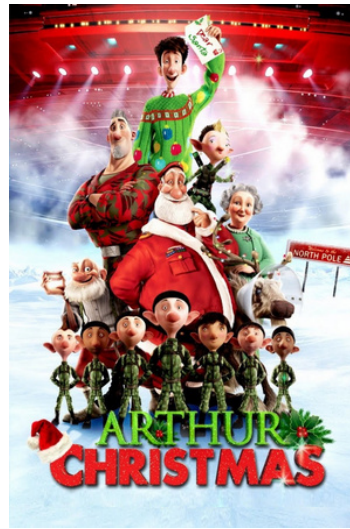
Arthur Christmas 21st December