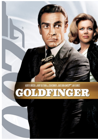
Goldfinger 06th December