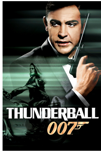
Thunderball 13th December