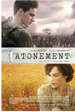
Atonement 30th November