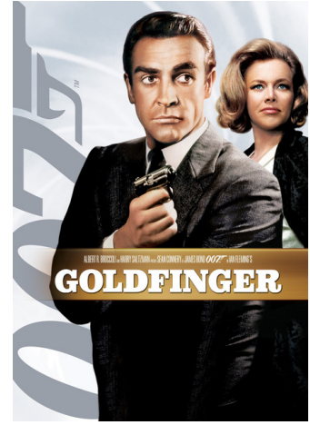
Goldfinger 06th December

To book, please put your name on the booking list once shared on the notice board.