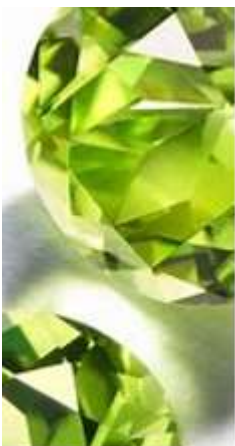
Birth Stone Peridot