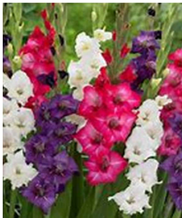
Birth Flower Gladiolus