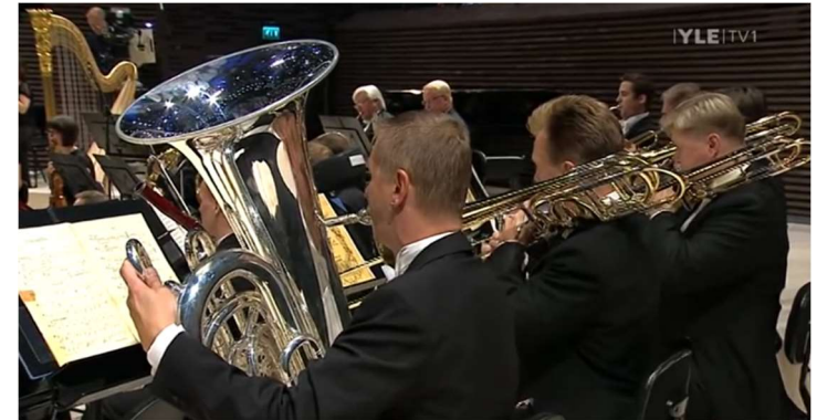
The opening of the new Helsinki Music Hall August 31, 2011