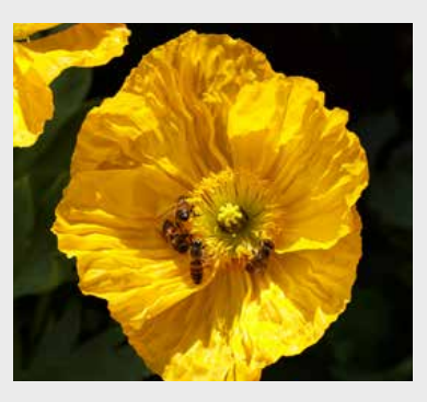
Bees on a bright-yellow poppy at Broadacres