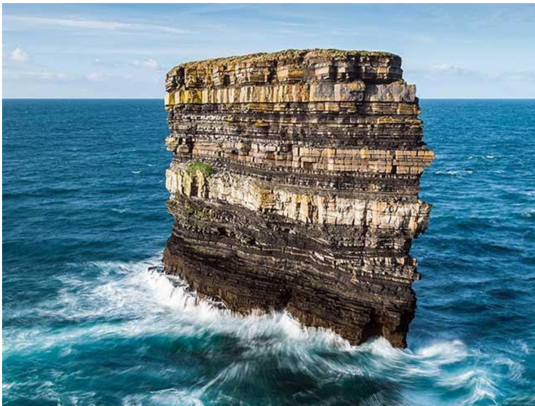
The history of the Earth in one chunk of rock