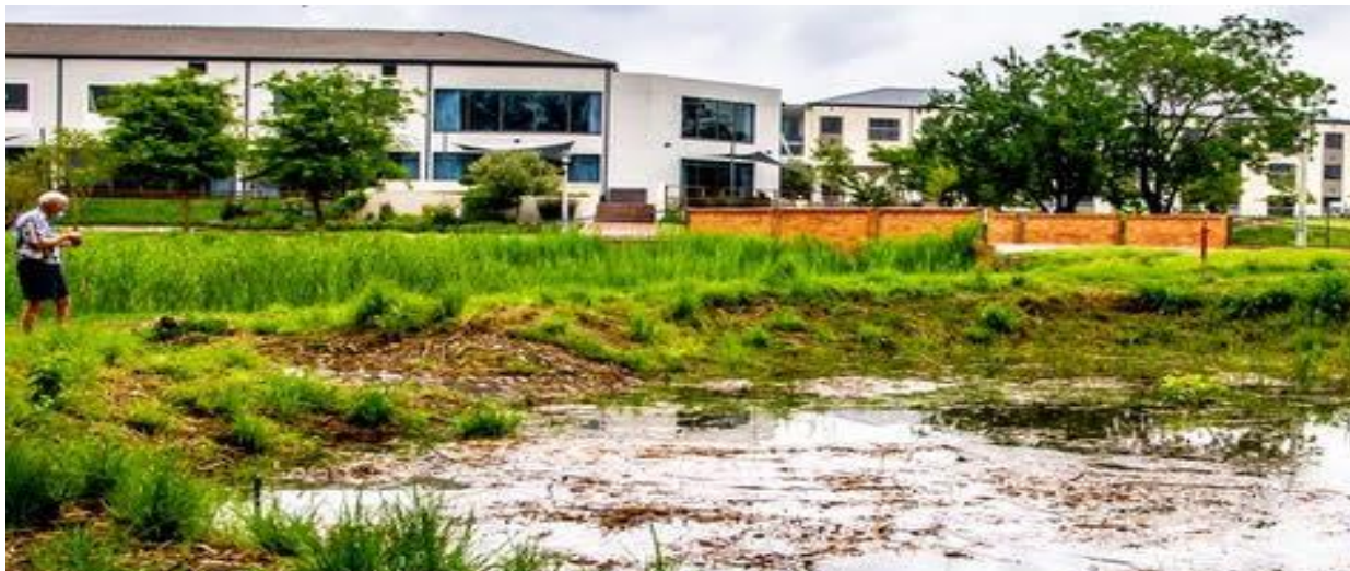
A rare event; Adi's dam in full flood