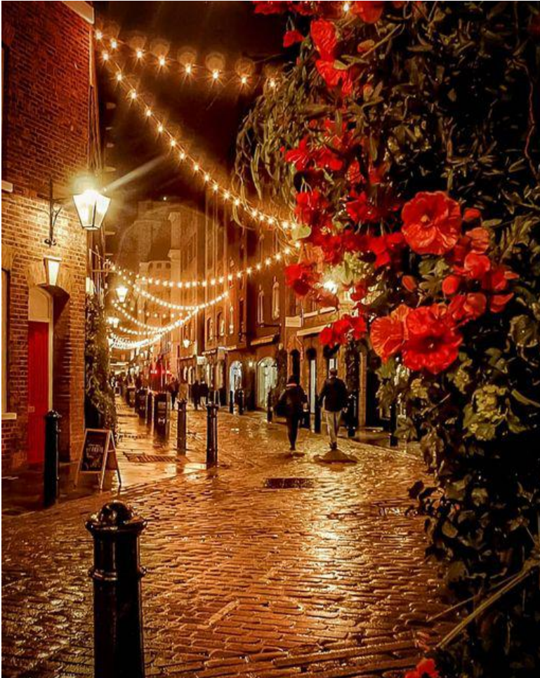
Covent Garden Christmas Eve