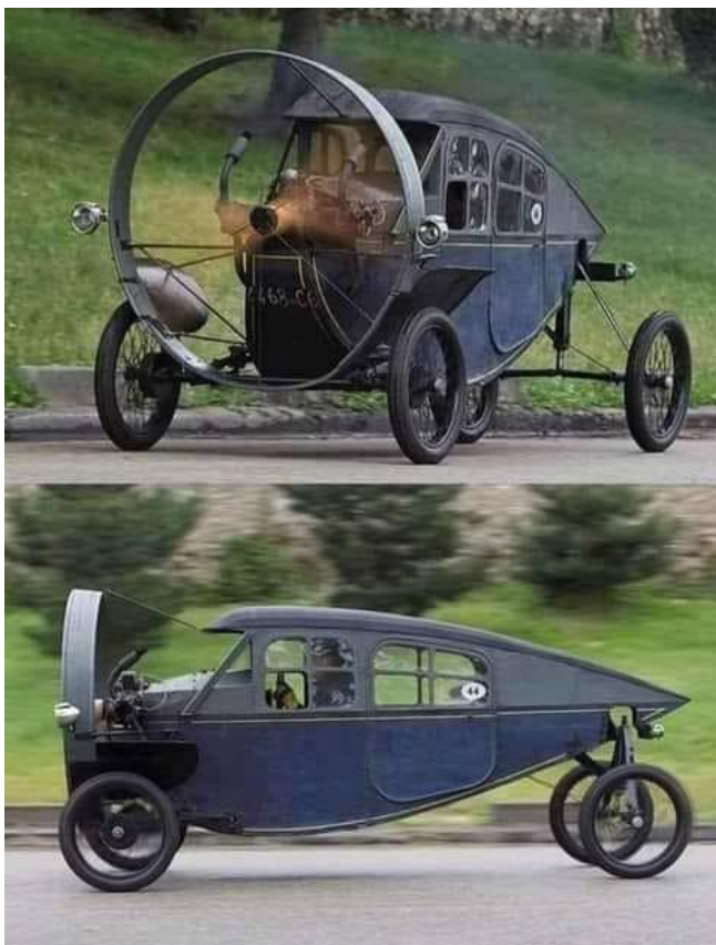
Next Project: A replacement for the Golf Cart