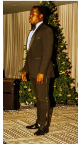
The Johannesburg Opera entertaining us