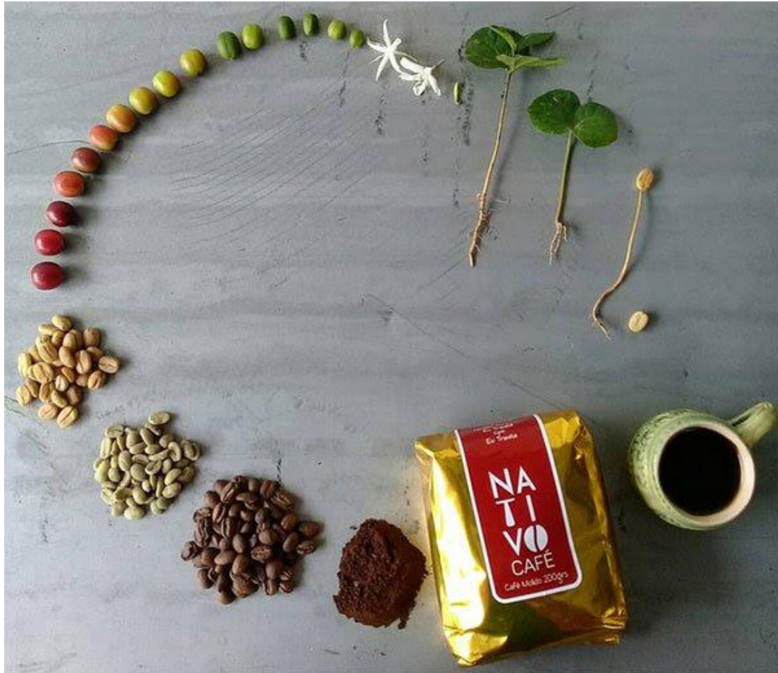
Bean to Cup The Story of Coffee