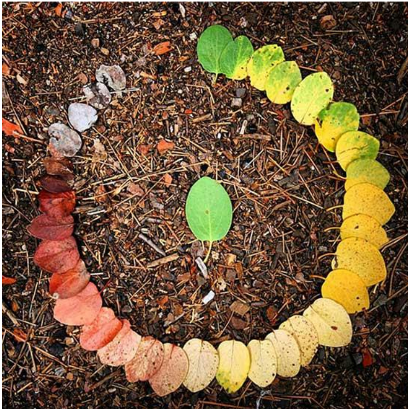
Life or Leaf Cycle