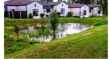
A flooded spillway, Adi's Dam and the Attenuation Dam all full!