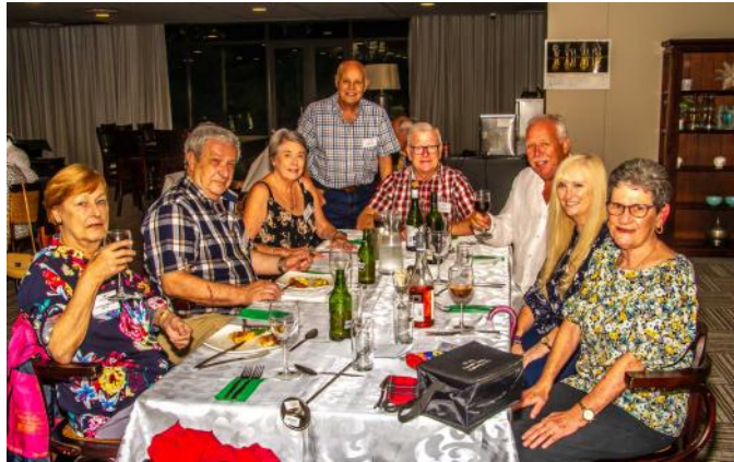
En Bloc Welcome to some of our newer residents