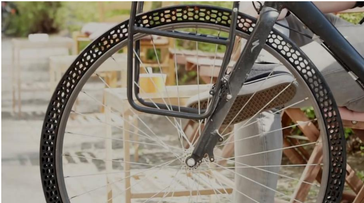
Airless Tyre - Remember you saw it in Chatter first!