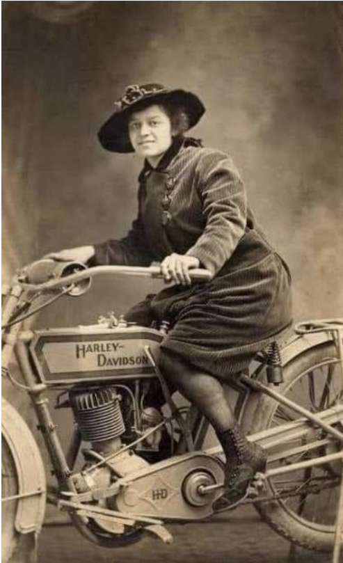
This picture has got nothing to do with anything here, except her bike is rather special.