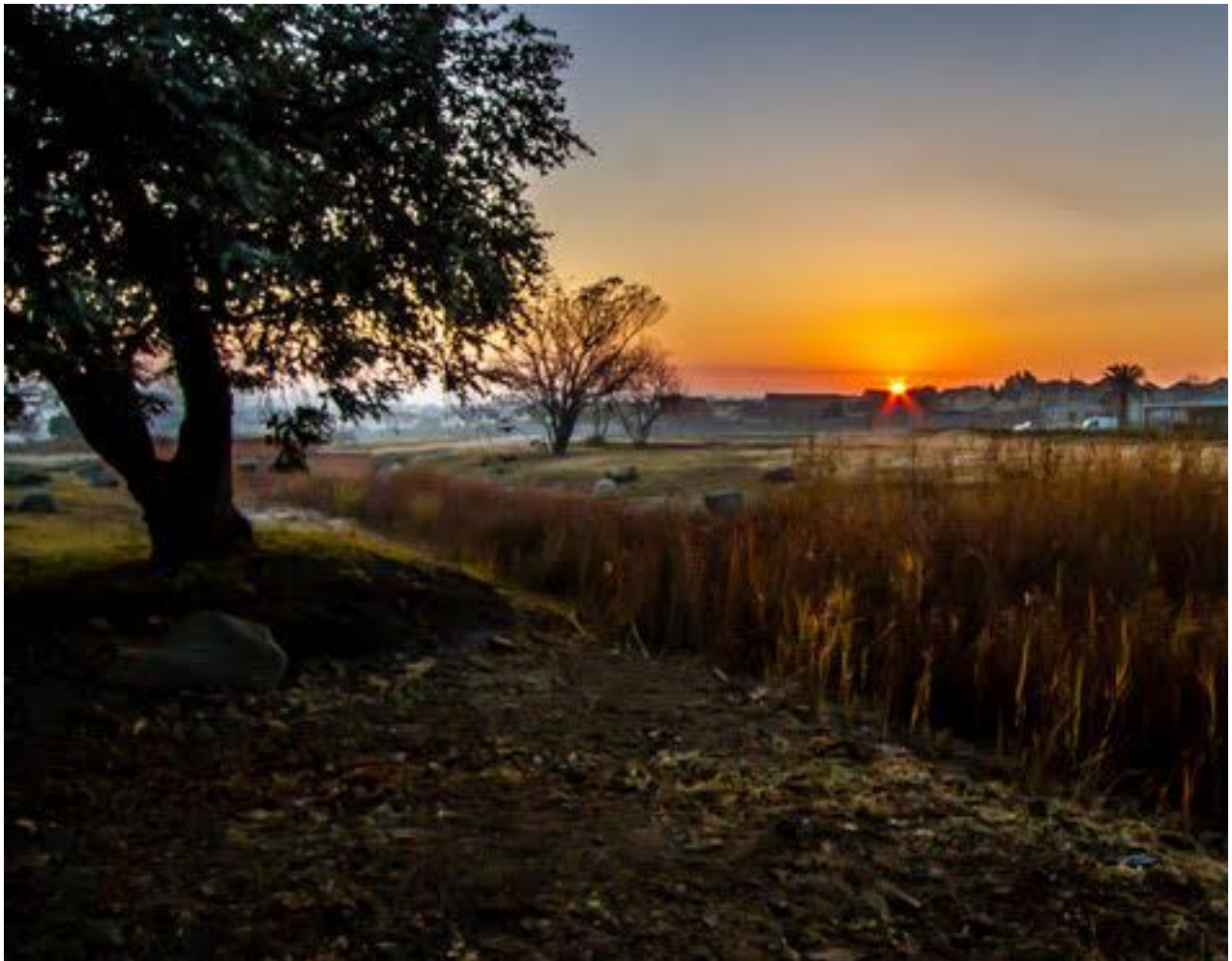
Evergreen Broadacres - Wetlands Sunrise (before Lifestyle Centre and Apartments) from Kiloran or was it a painting??

Speaking of Kate, she would like to thank those still dropping off loaves of bread for the soup kitchen. There is still a need to feed even when the weather is getting warmer, so get an extra loaf or loaves when you are out shopping.