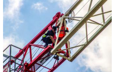
my stomach turns over just watching these guys