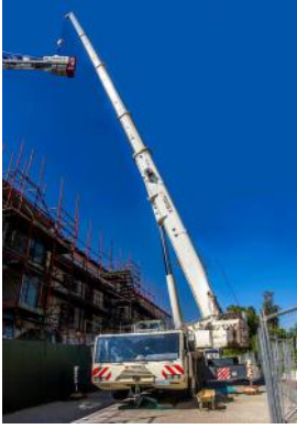
Get an even taller crane

(Take two fearless mountaineers, lotsa trucks, numerous visits by a dedicated and pony tailed photographer and then the next day not a sign that it had ever been there?)