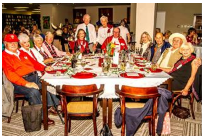
Too much of a mixture!!