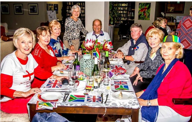
The SA / POM table - Leaving or Remaining?