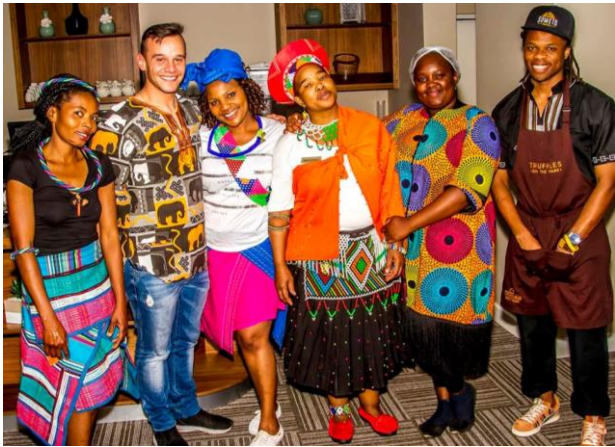
Bistro staff in their outfits.