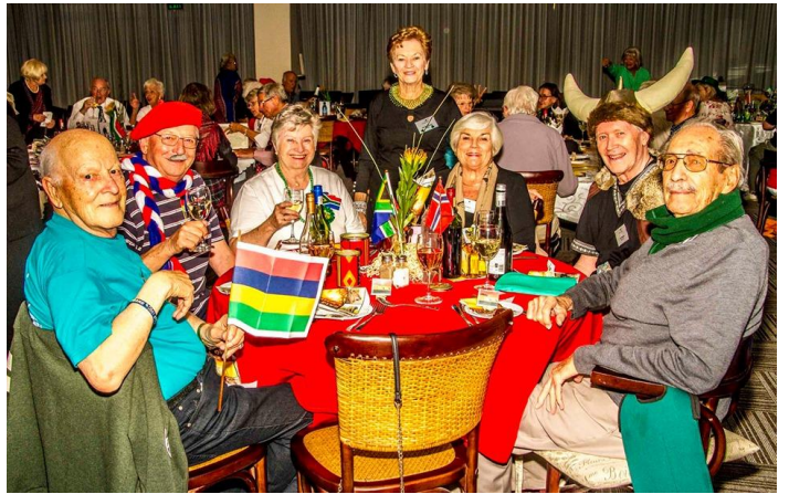
The EU table, dreaming of Brexit?