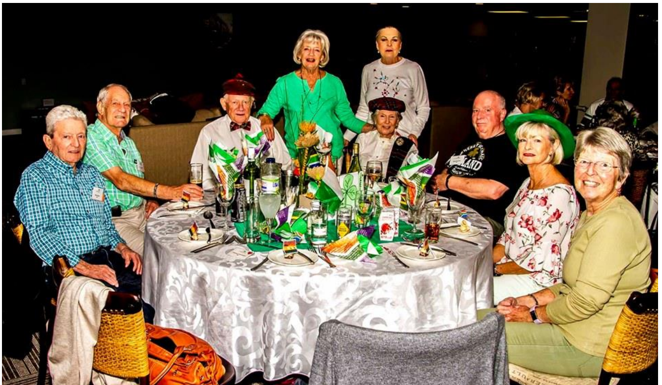
The Gaelic Celts - OK, where is the ceilidh?