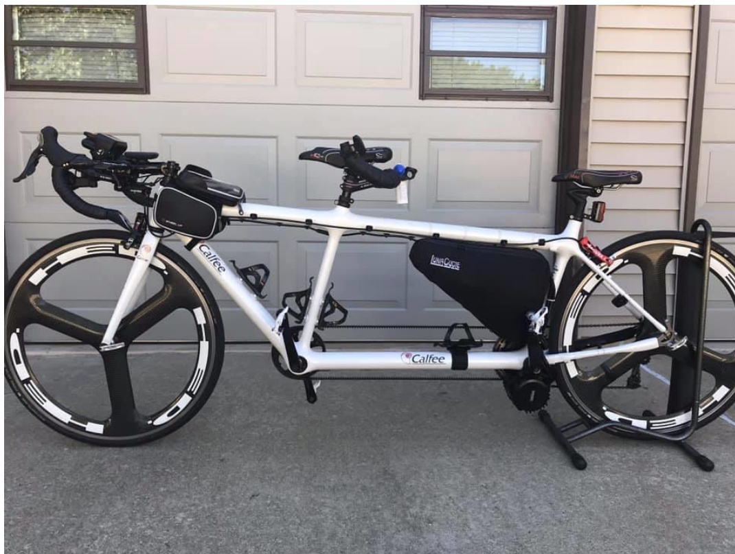
You have seen an e-bike and an e-trike, now look at an e-tandem!

JUST LIKE THAT (these are not attributed to anyone in particular but thank you so much to the usual suspects)