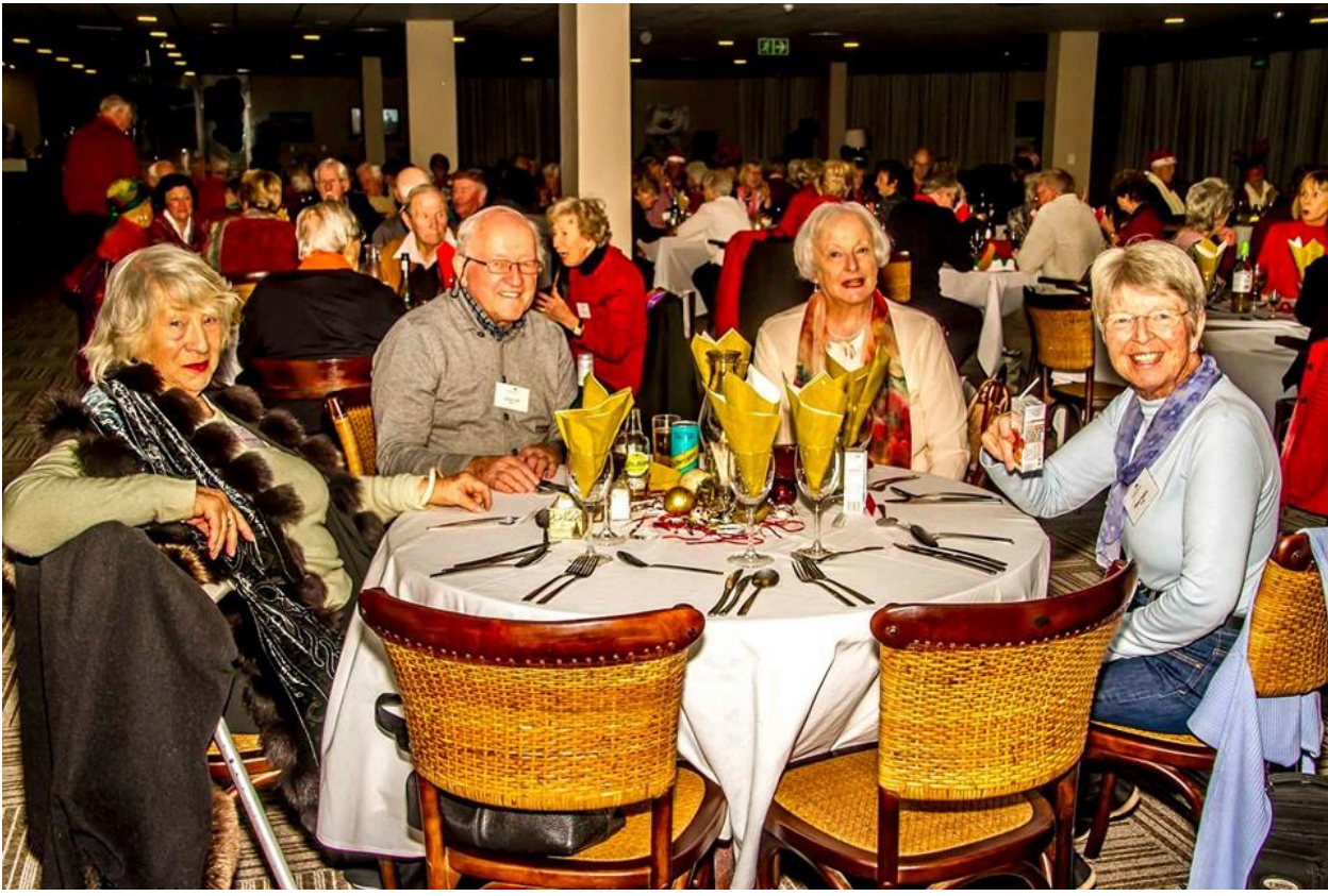
We welcome some new and newish faces