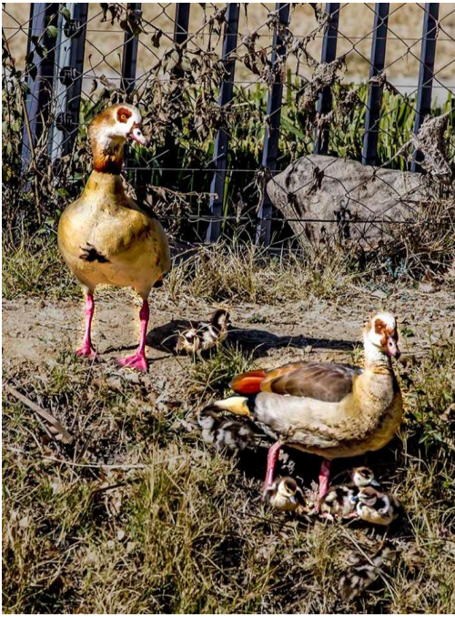
Our new top dam residents not ducks this time but geese. Mum & Dad Egyptian Geese and little goslings