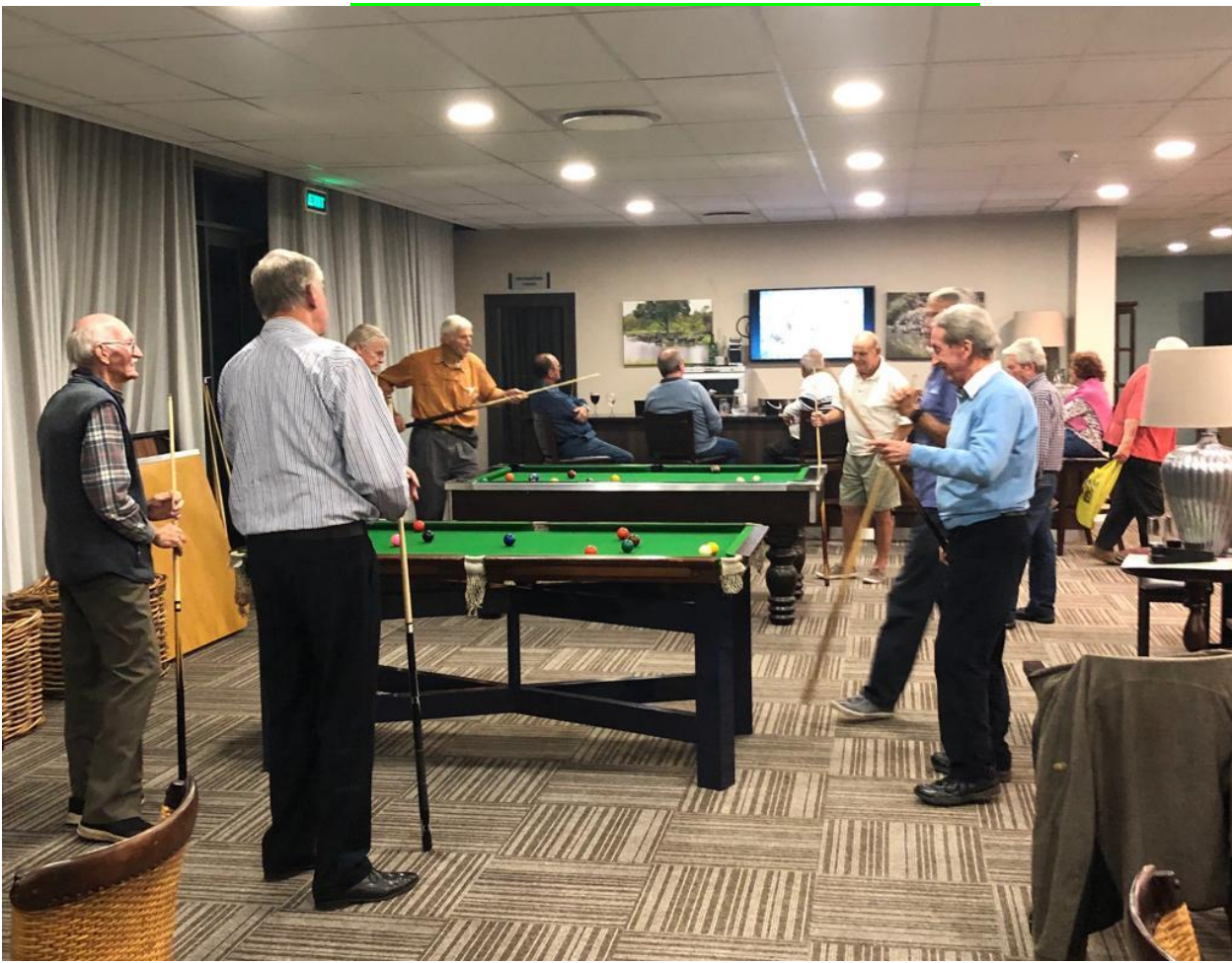
Men's Pool mulling over a Ladies Take-over