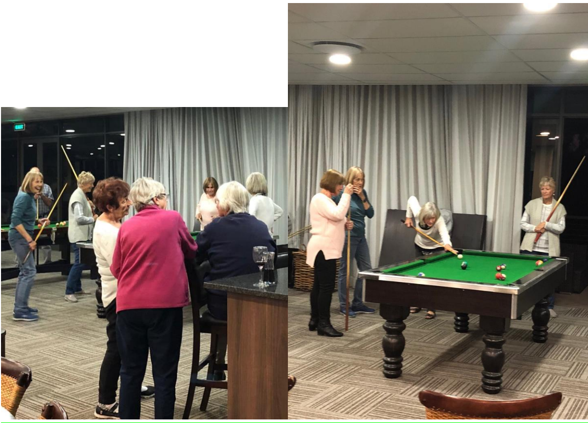
Ladies Pool takes off at the WaterHole