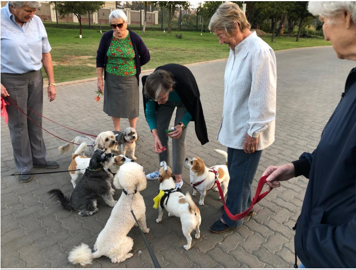
The Pied Piper of Evergreen - Just what causes 7 dogs to stand and sit in a circle?