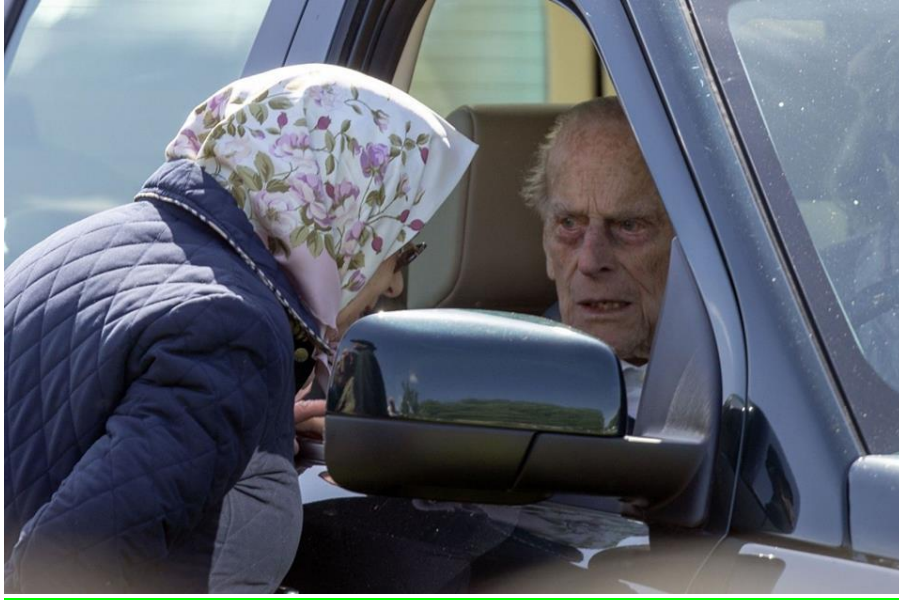
Buckingham Palace announce an invite to Donald Trump to see the Queen