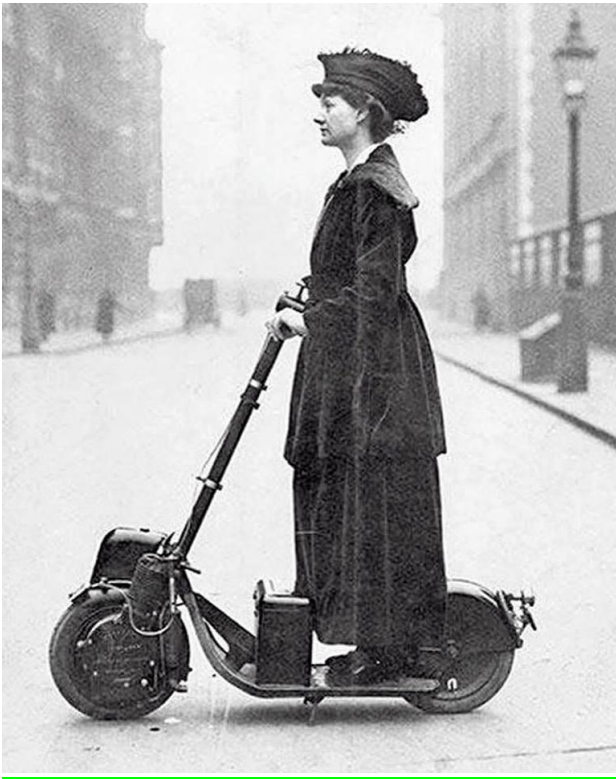
My Gran in 1916 - and you thought eScooters were modern?

I just finished building a car using a motor from a washing machine.