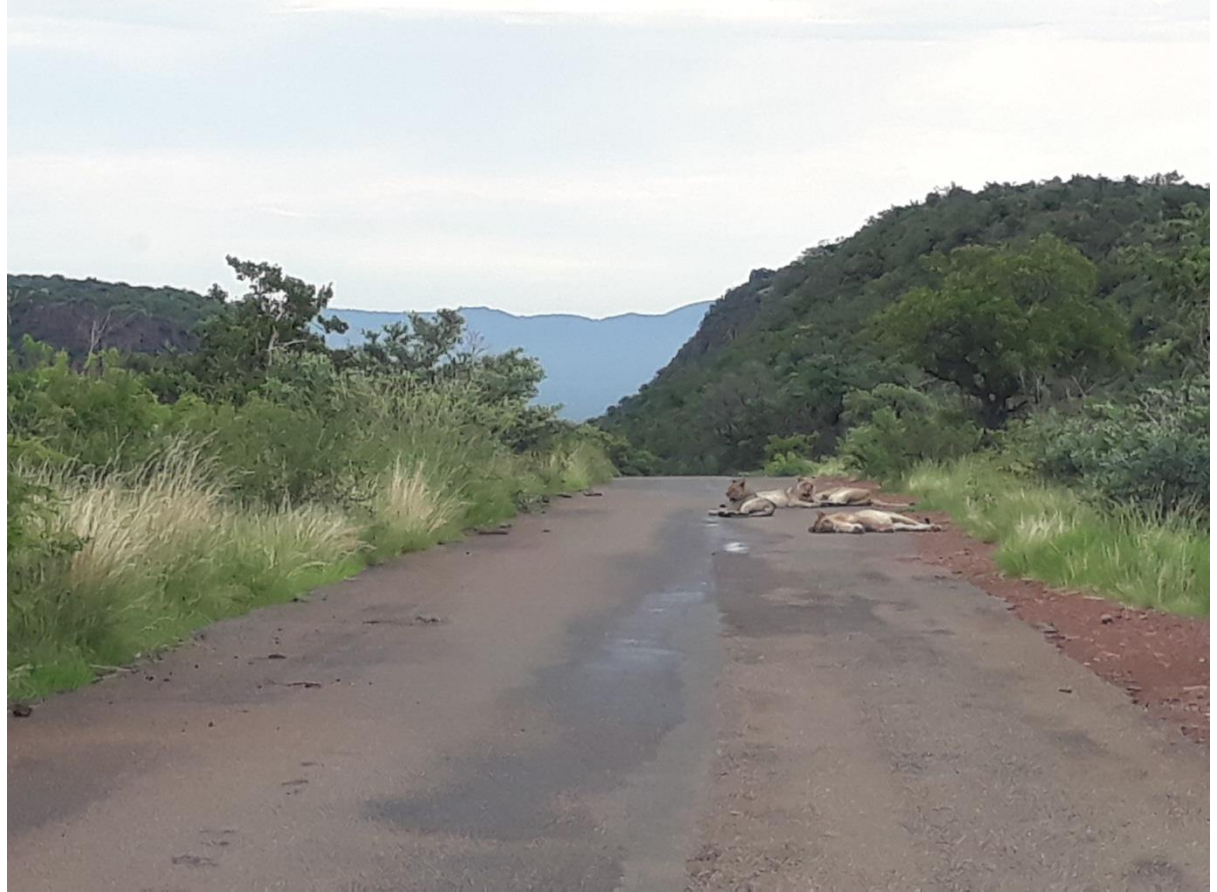
We found this lioness with her 3 sub-adult cubs, with mouths and paws covered in blood, slaking their thirst in a roadside puddle. We followed them along this road for about 30 minutes (without another vehicle appearing) until they eventually collapsed for a mid-morning nap.

The Park's altitude ranges from 1100 m on the plain to 2100 m at the Lenong look-out point. This results in vegetation ranging from dense bushveld savannah on the plane through dense mountain forests in the valleys and mountain savannah and grassland on the foothills. Game isn't plentiful but we had good sightings of Impala, zebra, lion and elephant.