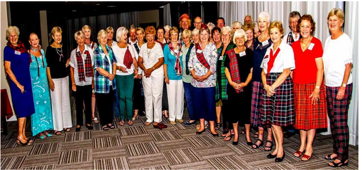
Our lovely ladies - Oh! what a sweet sight! (Hang on, there's that Pole again)