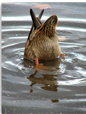
A lovely tail