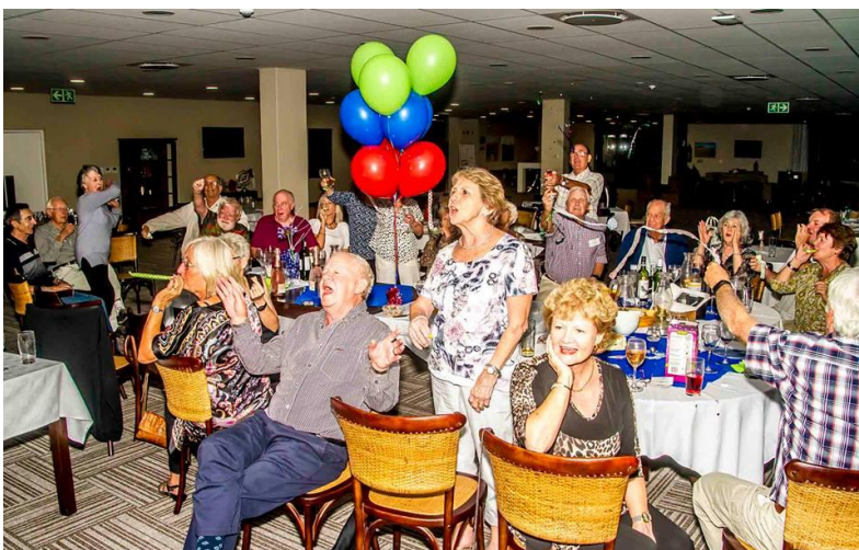
The actual moment when 2019 was born!