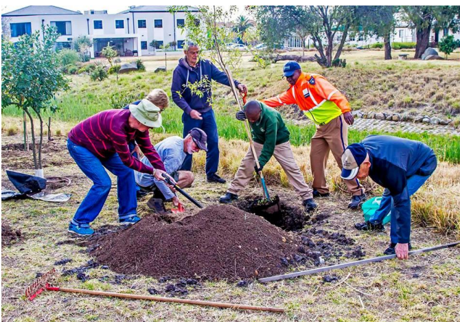
Poetry in motion