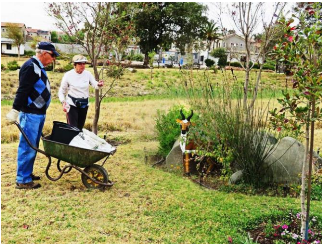
"Nobody mentioned planting a Springbok"