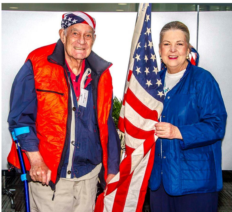
Dick and chick, just rolled in on their Harley Softail