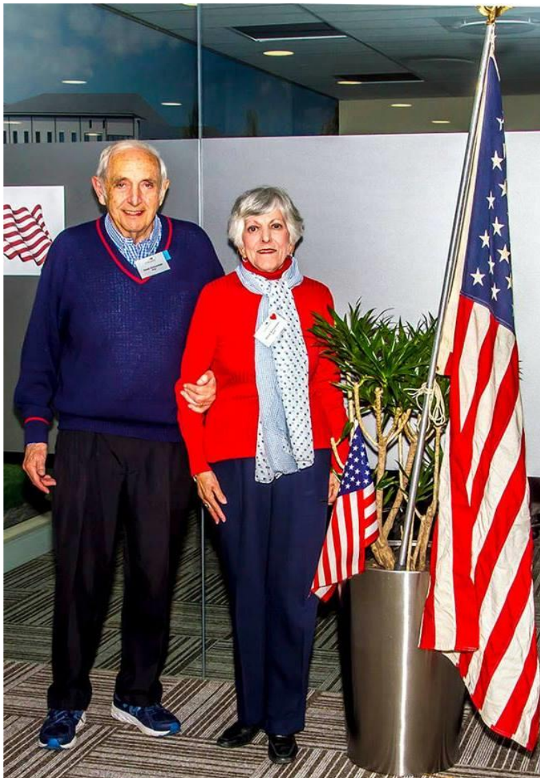
Our very own East Coast Girl!

Please contact 'Nice Juan Cyril ©' and Conchita y Tequila at Hacienda 123