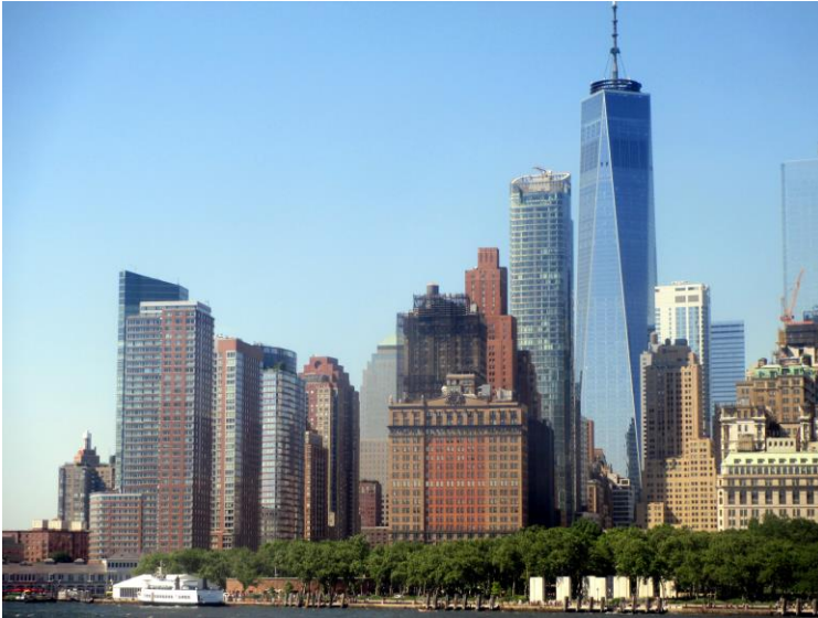
New York skyline from Staten Island Ferry