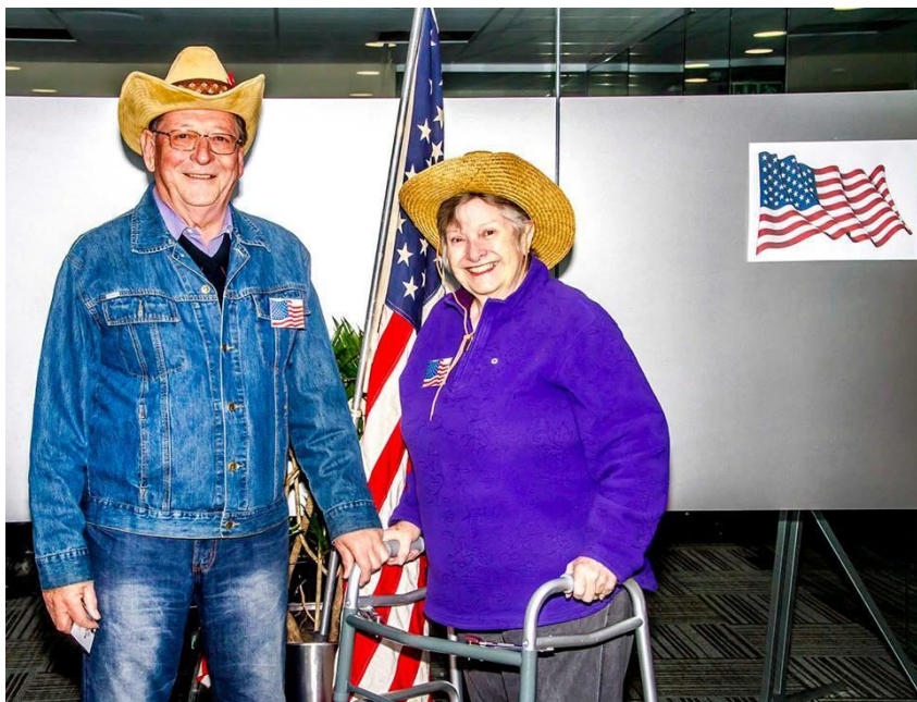
"For the last time, you are not taking that thing on our horse, Moira"