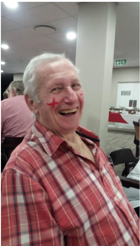
Cliffy was only two when he arrived from Co. Durham!