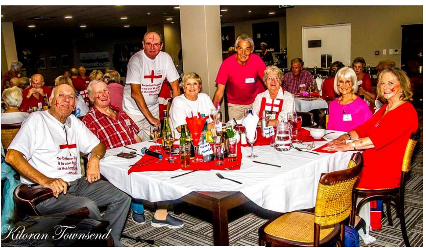
A full house of face paint