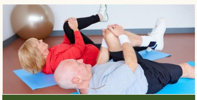
Fit, healthy muscles are less likely to waste away in old age

Researchers say they may have worked out why there is a natural loss of muscle in the legs as people age - and that it is due to a loss of nerves. In tests on 168 men, they found that nerves controlling the legs decreased by around 30% by the age of 75.