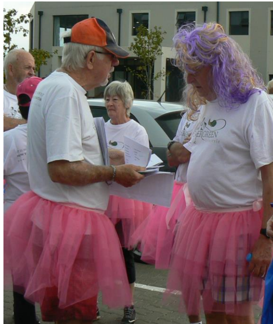
"Ma'am are you sure you are not pregnant?"