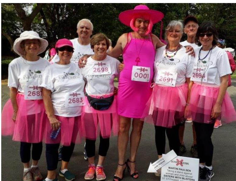
Members posing with No. 1