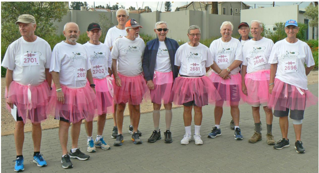
Team Ever-Queen men ready to protect the ladies