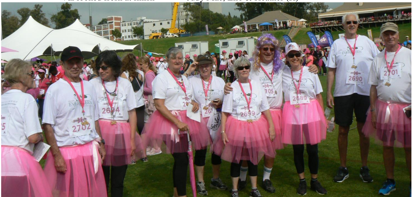
Team members gathered together at the finish