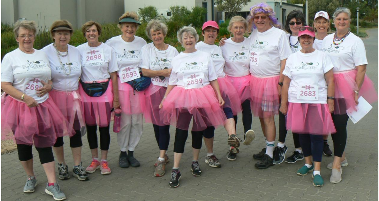
Team Evergreen ladies ready to walk for “The prevention of abuse to Women & Children”