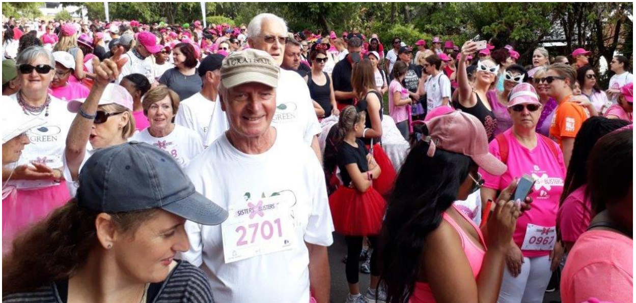
Members waiting for the start of the Walk