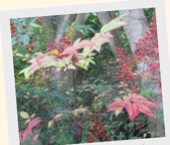
Pin leaves and red berries by Sue Beele Evergreen Muizenberg

Judge's comment: Slightly out of focus, but that only adds to its ethereal beauty.