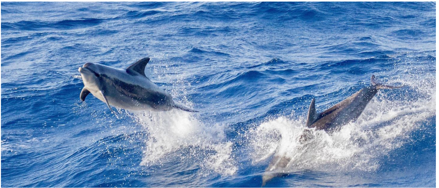
Above: Dolphins in the Red Sea.