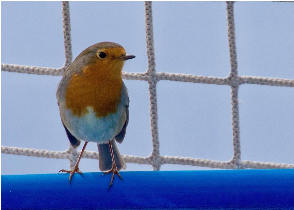
Below: A European Robin hitching a lift to South Africa