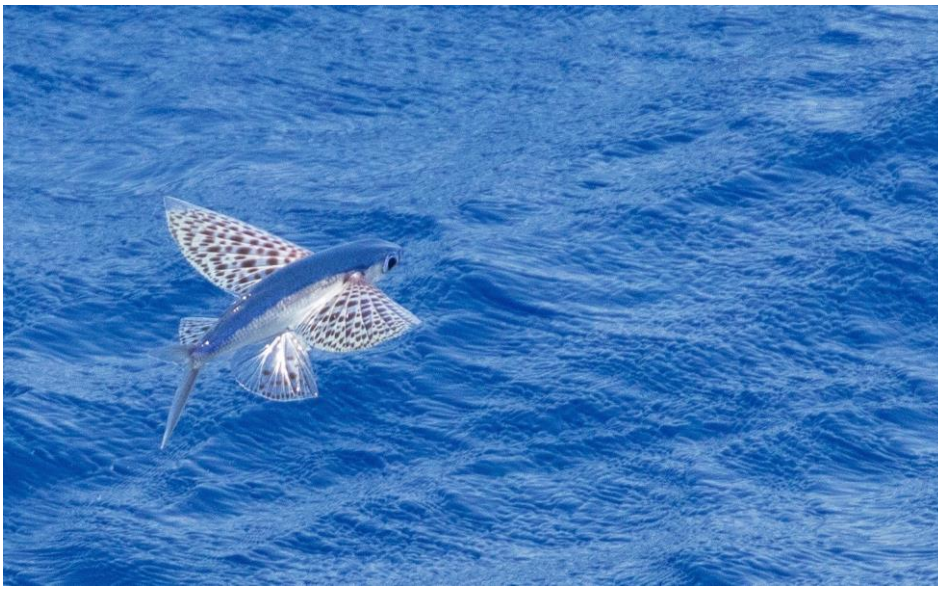
Flying Fish in the Arabian Sea