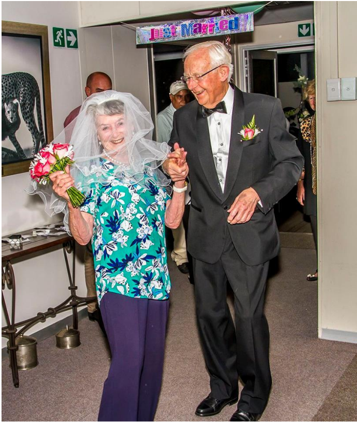
What a lovely couple and such a great reception