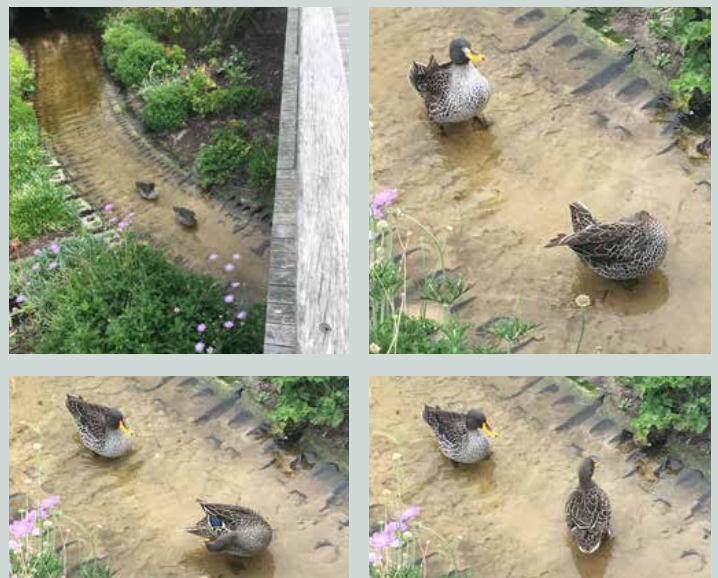
On a recent visit to Muizenberg, I found these two out for a bit of a stroll.

We love our gardens and we all enjoy the beautiful outdoor areas at our Evergreen villages, but everything from our newly-sunk borehole at Broadacres to our valuable underground water source in Muizenberg, should be used frugally, so let's remember we're all in this together!