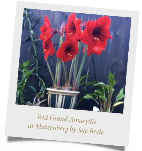
Red Grand Amaryllis at Muizenberg