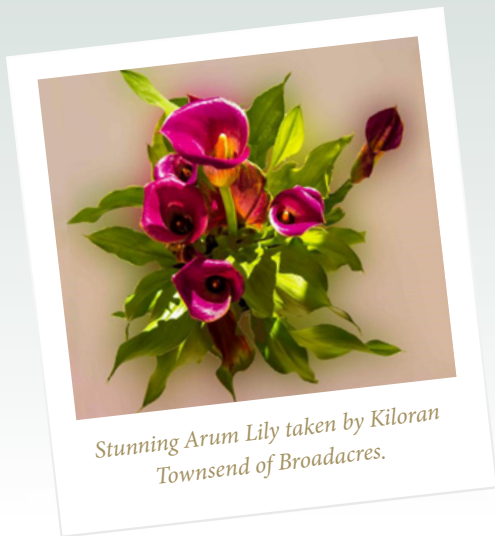
Stunning Arum Lily