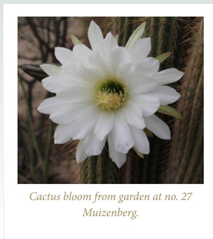
Cactus bloom from garden at no. 27 Muizenberg.