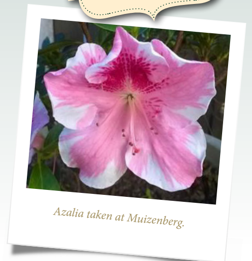
Azalia taken at Muizenberg.