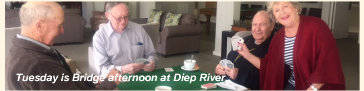
Tuesday is Bridge afternoon at Diep River