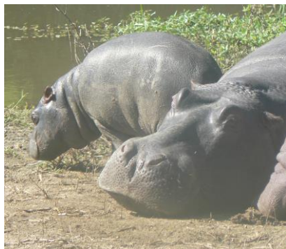
Brand new baby hip