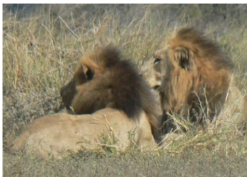
Two magnificent black manned lions