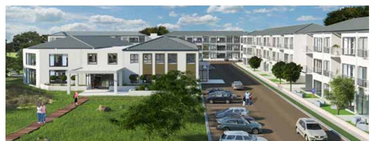
COMING 2017! Broadacres Lifestyle Centre

There is much more to come as our Evergreen business matures, so watch this space!