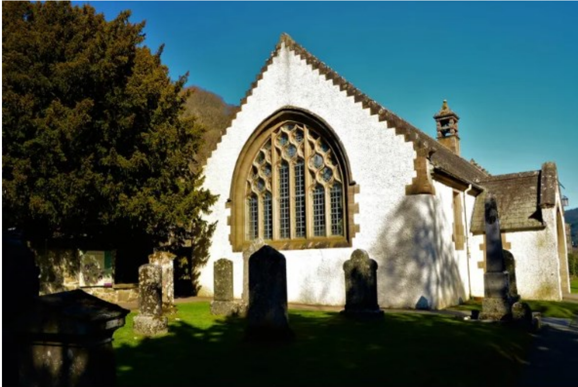
The old church building and millennia-old yew tree at Fortingall in rural Perthshire.