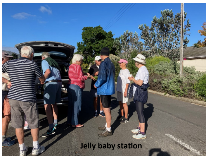
Jelly baby station