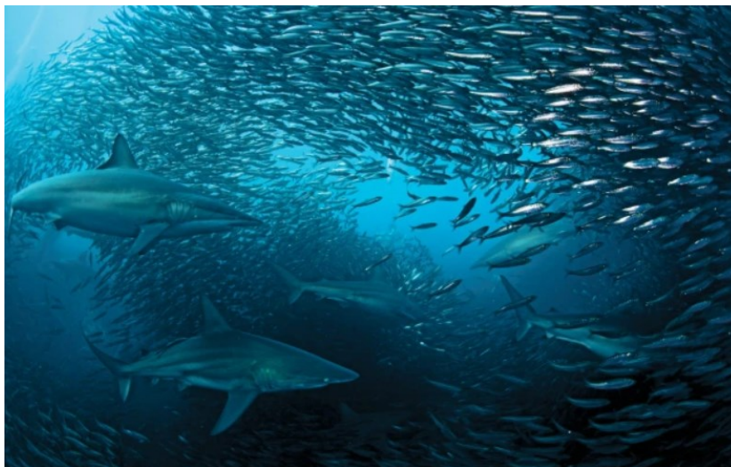
Sardine run Port St. Johns facesofthesea.com

Seabirds also attack them from above, flocks of gannets, cormorants, terns and gulls. Other 'stalkers' include whales, game fish and seals. https://en.wikipedia.org/wiki/Bait_ball