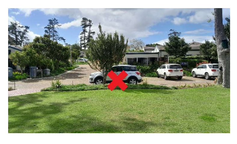
Do not park outside the clubhouse