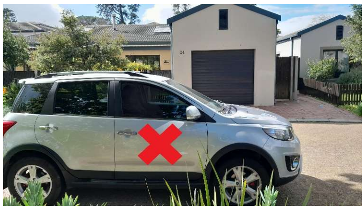
Do not park next to the clubhouse lawn