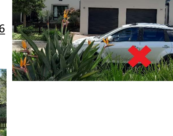
Do not park outside unit 24