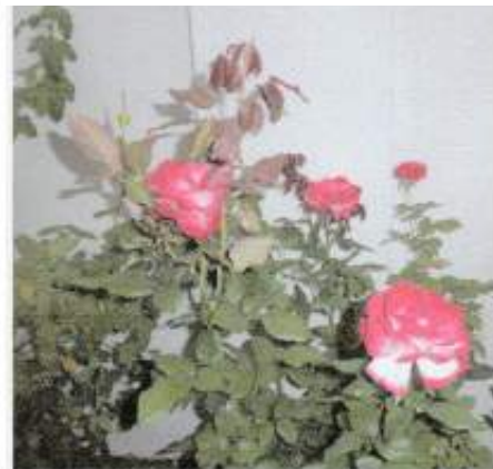
A rose called "Saints Jubilee"