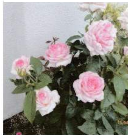
A beautiful pink rose called "Thuli Modonsela"