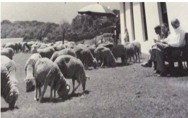
Quicker than a lawn mower !