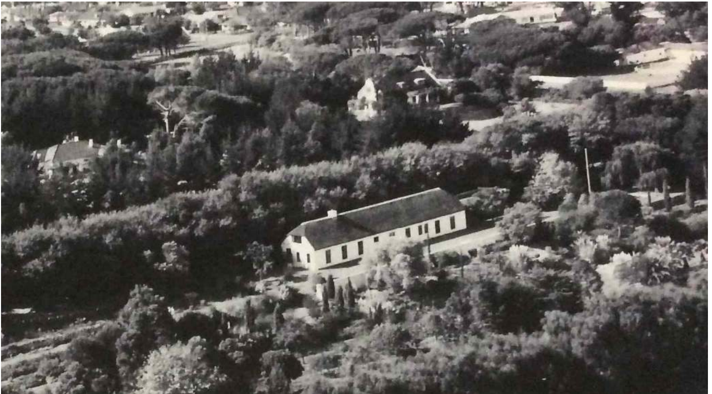
Prior to the construction of the Simon van der Stel Freeway, colloquially known as the Blue Route Freeway