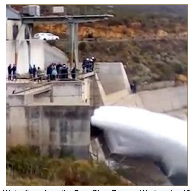
Water flows from the Berg River Dam on Wednesday 18 April 2018.

There is now double the amount of water in the city's supply dams than there was at this time last year, when the level stood at 25.1%.