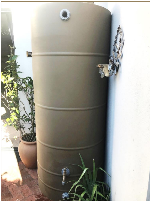
Above: Installation of eco tank at unit

The installation of rain water slim line tanks in the village is progressing well.