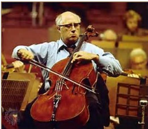
Above: Mstislav Rostropovitch

SCRABBLE is going strong with enthusiastic ladies pitting their wits against each other on Tuesday afternoons at 2:00pm